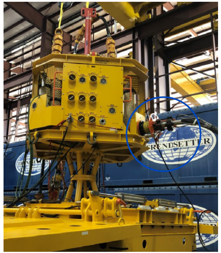
The TC2 Hydraulic Connectors can be configured vertically and horizontally to fit your needs.

Industry standard interfaces make the TC2 a perfect fit.